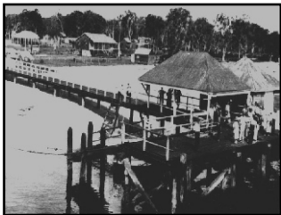
Bribie Jetty 1930

In World War 2 the island was a significant strategic military base for training Australian and American troops. Fort Bribie was one end of the 'Brisbane Line' for the defence of Brisbane Port.